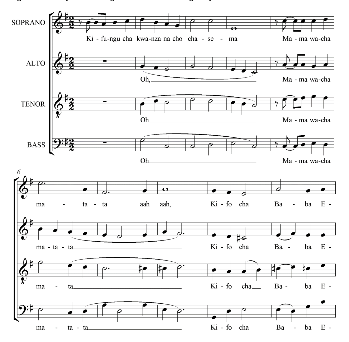
Figure 2: Excerpt of the song DerevaKombo arranged by Ooko

Kabarak University, Nakuru, Kenya, 24<sup>th</sup> – 26<sup>th</sup> October 2018