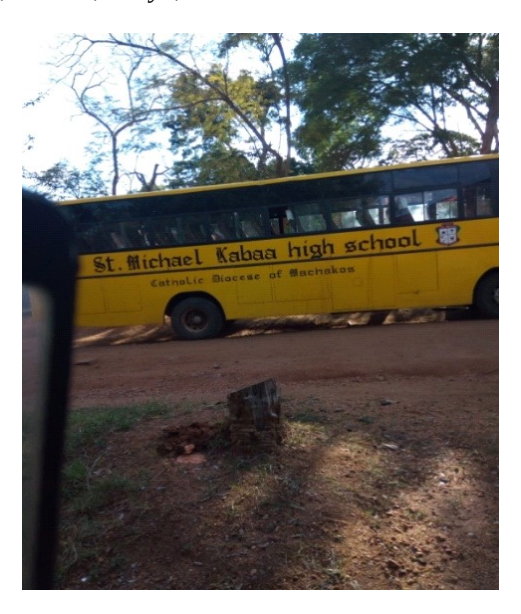
Plate 5: The school bus repainted inMatiang'i's school vehicle colours