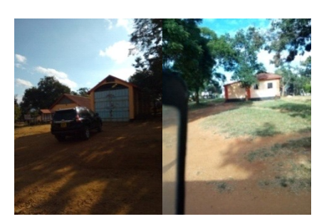
Plate (ii) & (iii) Some of the School buildings,