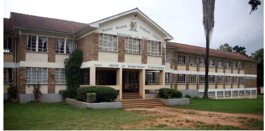
Plate 9: St. Mary's Yala

The end of the primary school level was standard IV where learners sat for a Common Entrance Examinations (CEE). The CEE was regional and each region (Province) of Kenya had her own separate examination-papers. For example, there was specific CEE for Central Province known as CEE (Central), one for Nyanza Province known as CEE (Nyanza), etc. The end Exams for this level were used to select students who would join the next level of Education in the Country, the Intermediate school level. It should be noted that during this time there were very few Intermediate Schools in Kenya. In such mission schools, students went through a curriculum that prepared them for the Kenya African Preliminary Examinations (KAPE) that was done in Standard Eight (VIII); also known as Form Two then. At this level, students learnt English, history, Kiswahili, Geography, Nature Study & Hygiene, Agriculture, Rural Carpentry and Record of Activities. One such Catholic Mission schools – Primary, headed by Irish priests which prepared candidates for Higher Education was St. Mary's Mission School at Yala, the then Central Nyanza.